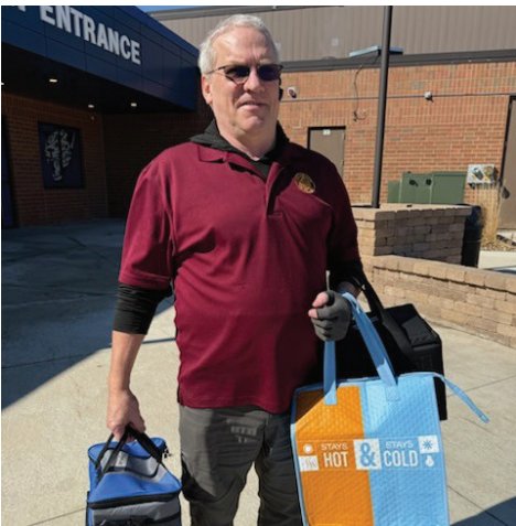
Al at Meals on Wheels

For more information, please visit https://www.mealsonwheelsamerica.org/